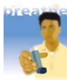
Asthma Awareness Poster